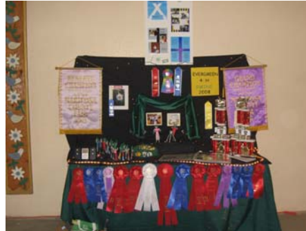
Best Club Table Display Evergreen 4-H Club