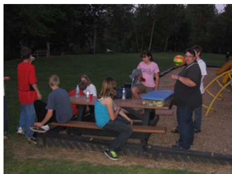
4-H Teens having a great time after their scavenger hunt.