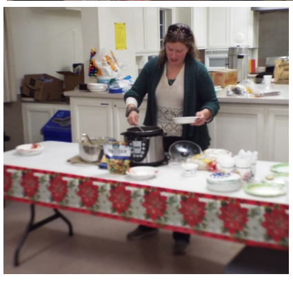
Thank you to the Triangle

and Clover Pioneers Clubs in chairing the Christmas Float and Christmas Party. And thank you to all the members and parents who participated.