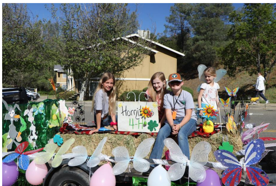
The Hornitos Club float cruised through the parade in style and was designed and inspired completely by the members pictured here. GREAT JOB!